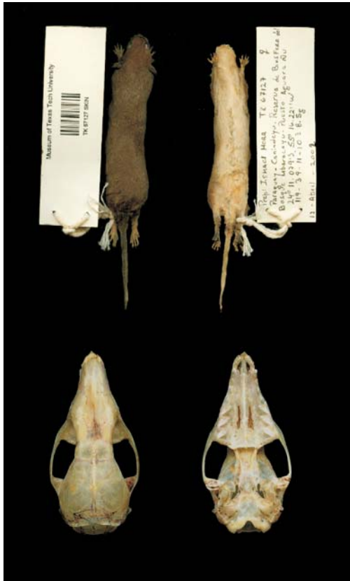
Fig. 2. Skin and skull of Paraguayan Monodelphis kunsii , specimen TK 67127. Top: Dorsal and ventral view of the skin. Bottom: Dorsal and ventral view of the skull.

matic and contrasting differential coloration in dorsal and ventral view, as in Thylamys . Short uniformly reddish-brown dorsal fur, without any distinguishable coloration marks, paler underparts, and lack of sagittal crest (Fig. 2) are all typical of M. kunsii specimens (Anderson, 1982). Monodelphis kunsii has been identified as the smallest Monodelphis and it is perhaps the smallest didelphid other than Chacodelphis formosa (see Pine, 1975; Voss et al., 2004; Teta et al., 2006). Both TK 67127 and TK 121105 have fully erupted fourth molars (Fig. 2), which are characteristic of adult Monodelphis , and confirm that these are adults, rather than juveniles of a larger species. See Table 2 for measurements of these specimens.