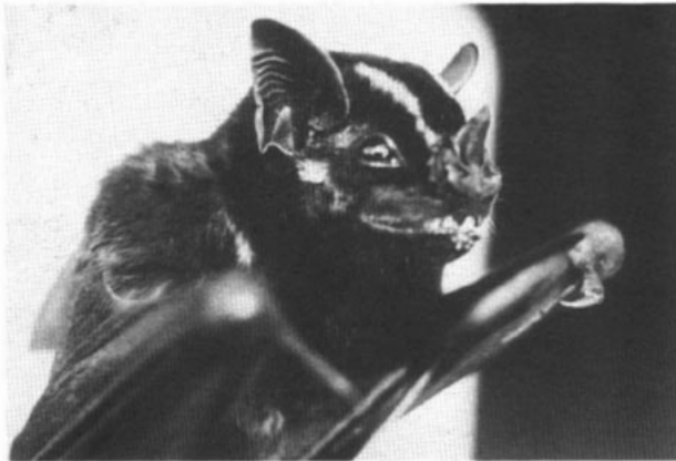
FIG. 2. Enchisthenes hartii from Tingo María, Huanuco, Perú.

across M2-M2, 8.5 (8.1–8.8); length of maxillary tooththrow, 6.9 (6.7–7.2); length of mandibular tooththrow, 7.2 (7.0–7.5—Gardner et al., 1970). Averages for external measurements for 39 males and 36 females, respectively, from northern South America, are: total length, 60.3, 61.0; length of hind foot, 12.1, 12.0; length of ear, 15.9, 15.8; length of forearm, 39.2, 39.2; mass, 17.4, 17.3 g (Eisenberg, 1989).