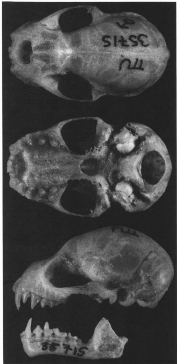
FIG. 1. Dorsal, ventral, and lateral views of cranium, and lateral view of mandible of a male Koopmania concolor from Sar-amacca Dist., Suriname. Greatest length of skull is 20.85 mm.

Swanepoel and Genoways (1979) reviewed morphometric values that had been recorded for the species before 1976. Eisenberg (1989) listed mean values for external measurements of a series of Venezuelan specimens, including average adult body mass of 18.33 g (males) and 19.98 g (females). Mean values and ranges of a series of K. concolor from Colombia (Barriga-Bonilla, 1965b), followed by values for specimens from Brazil (Andersen, 1908) and the holotype