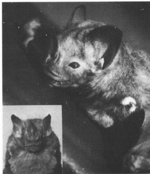
FIGURE 1. Oblique and frontal photographs of Pygoderma bilabiatum from Brazil.