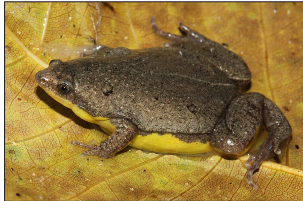
Figure 2. Elachistocleis matogrosso (CZPLT-H-517) from Reserva Natural de Laguna Blanca, San Pedro, Paraguay.