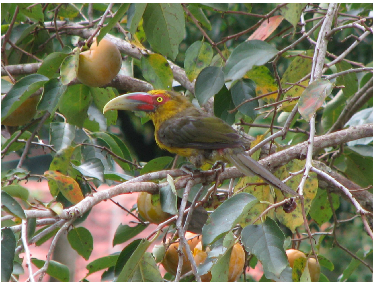
Tuká pakova, 9-3-2008

Bernard Oosterbaan Reigerstraat 140 2025 XG Haarlem The Netherlands bwj.oosterbaan@orange.nl